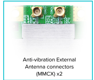
Anti-vibration External Antenna connectors (MMCX) x2

The MT7915DAN chipset combines the Wi-Fi MAC and BBP subsystems, working together with the MT7915DAN chipset, to deliver best-in-class radio performance and low power consumption. It also supports MU-MIMO with different configurations for enhanced multi-user connectivity. The module utilizes PCIe 2.1 for stable bandwidth between the host platform and the chipset. It provides high data throughput over WiFi and is designed for optimal performance and power efficiency. Additionally, it features anti-vibration External Antenna connectors (MMCX) x2 for enhanced signal stability.