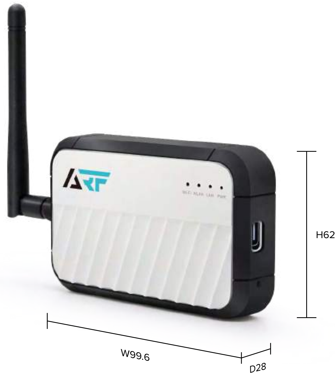
Wi-Fi HaLow Wearable Gateway ARFHL-UM